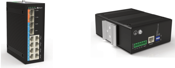
Layer 2 Managed Industrial Switch